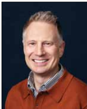
Brian Holtzclaw Mayor Pro Tem Position 4 Term expires 12/31/17