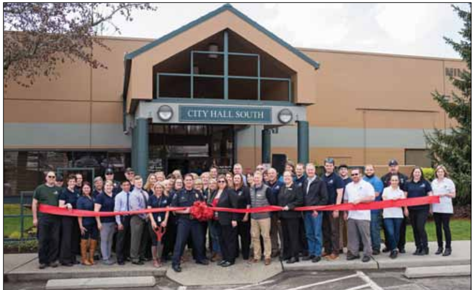
City Staff at the April 18 Open House